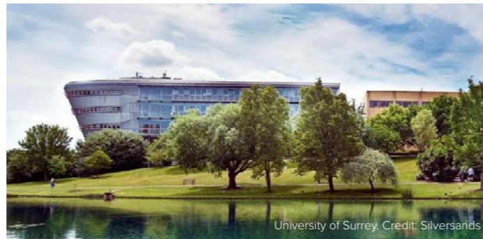
University of Surrey.

topics include, Detection systems, Muon detection for core monitoring (including WATCHMAN), Algorithms and Autonomous Decision Making and UAV Monitoring and Environmental Measurements.