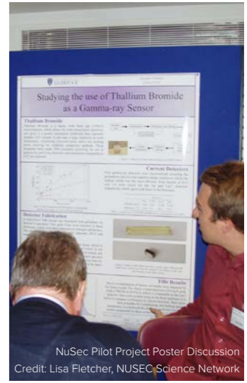
NuSec Pilot Project Poster Discussion.